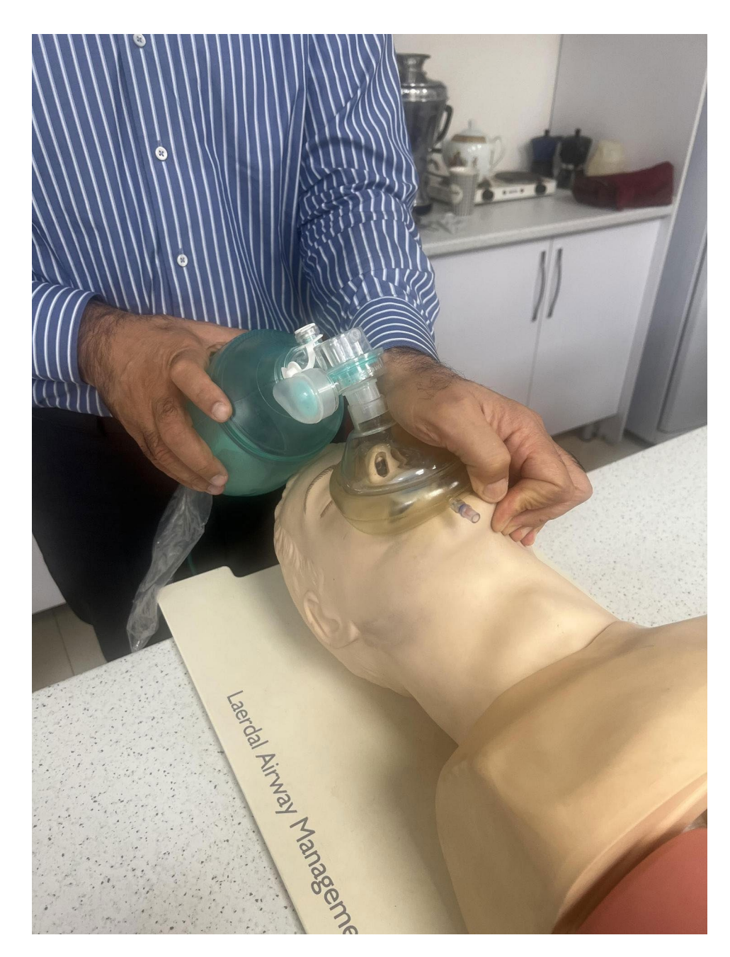
Fig. 2 Thenar Eminence (T/E) technique application in a manikin

Balafar et al. BMC Anesthesiology (2023) 23:384 Page 4 of 8