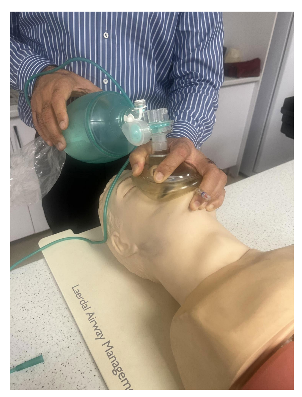
Fig. 1 E/C technique application in a manikin

Balafar et al. BMC Anesthesiology (2023) 23:384 Page 3 of 8