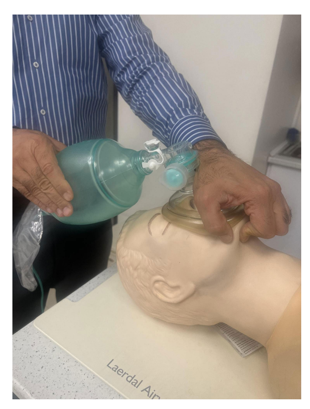
Fig. 3 Hook technique application in a manikin

Balafar et al. BMC Anesthesiology (2023) 23:384 Page 5 of 8