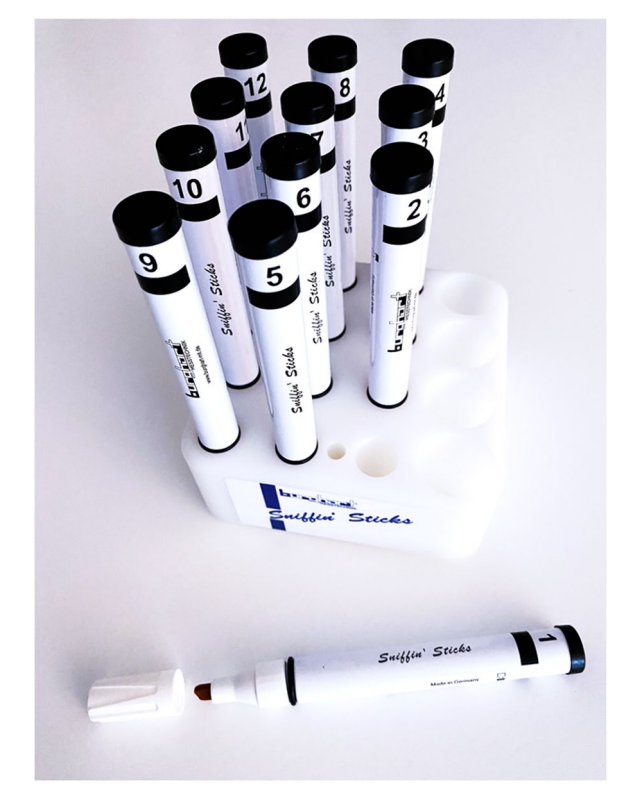
Fig. 1 The Sniffin' Sticks 12-item identification test (Burghart Messtechnik GmbH, Wedel, Germany). Legend: This test consists of 12 pen-like odor dispensing devices, each displaying a different odor. The patient is asked each time to make a forced choice from a list of 4 descriptors. Total olfactory score ranges from 0 to 12 points, where 12 is the best score

The preoperative and postoperative olfactory identification tests were identical. To minimize test–retest bias, the patients were not told about their test results during the preoperative assessment. We calculated postoperative change in olfactory identification score as the numerical difference of postoperative olfactory