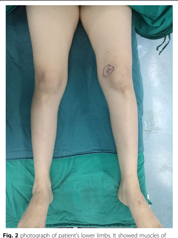
Fig. 2 photograph of patient's lower limbs. It showed muscles of lower limbs atrophy slightly. Muscle strength of the lower limbs was at level 4, whereas muscle tension was decreased