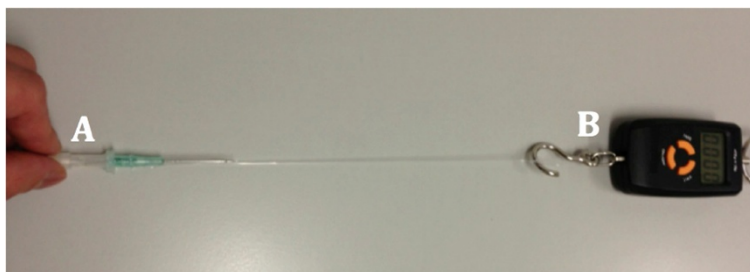
Figure 2 Setup up to indirectly measure static friction by recording the force required to displace the catheter away from the needle. Consisting of A : intravenous cannula; B : electronic spring scale.

values in each group were compared by a two-tailed, unpaired heteroscedastic Student's t -test. P values of < 0.05 were considered statistically significant. Variance was reported by using standard deviations (SD), relative standard deviations (RSD) and 95% confidence intervals (95% CI).